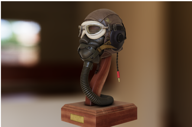
Fig. 3. A physically-based rendering in F3D (glTF file).